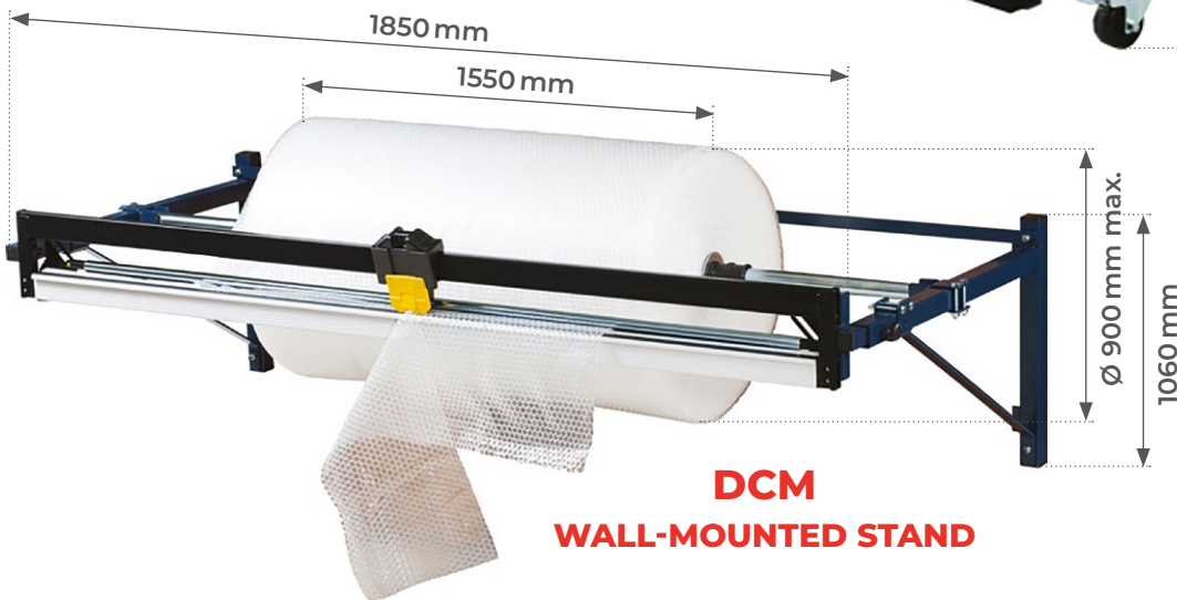
DCM WALL-MOUNTED STAND