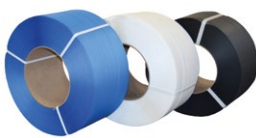
PP strapping (see page 17)