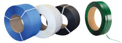
PP and PET strapping (see pages 17-18)