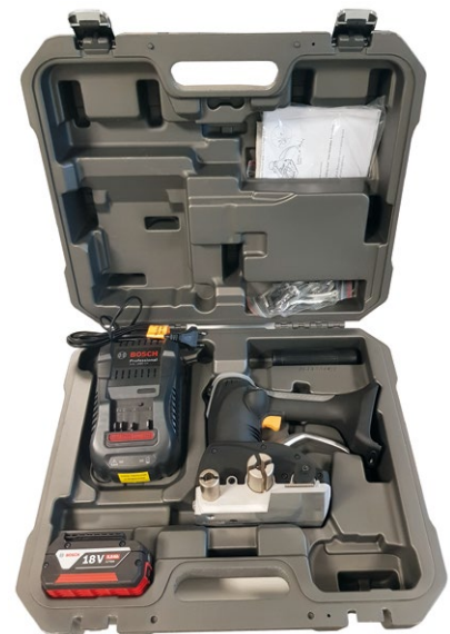
Carrying case included