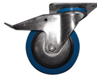
Silent non-marking blue rubber casters with thread guards