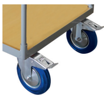
Two braked swivel casters