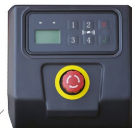
LCD display with PIN start by PIN code and RFID card