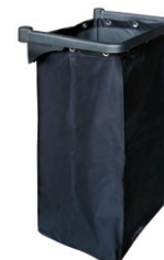
S-SUPPSACPLUS Bag holder 400x310x780 mm