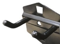
S-CROCHETC Short hook