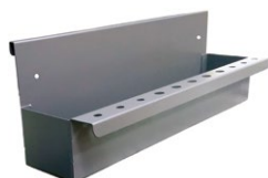
S-PO Screwdriver holder