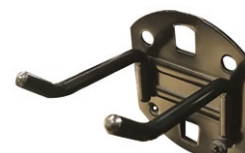
S-CROCHETL Long hook