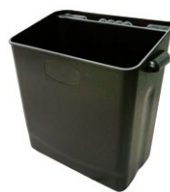
S-BACL Removable bucket 390x255x380 mm