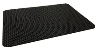
S-TAPISC Anti-slip rubber mats for S2C and S3C