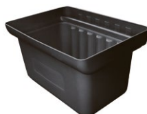
S-BACC Removable bucket 350x240x200 mm