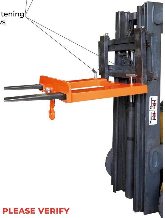
Safety tightening screws

PLEASE VERIFY ATTACHMENT MATCHES FORKLIFT CAPACITIES