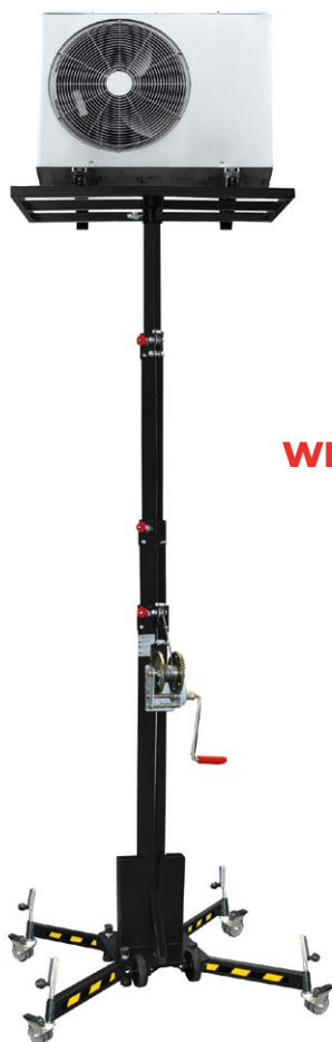
LP125R WITH TOP RACK