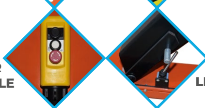
UPPER TRAVEL LIMIT SWITCH