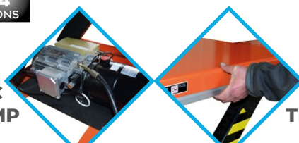
SAFETY TRIP BARS