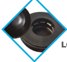
REINFORCED WHEEL LOCK