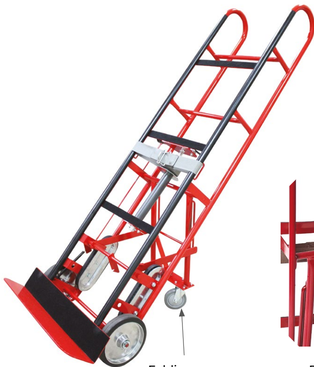
Folding rear carriage