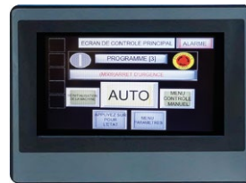
Motorized pre-stretch 230 or 300 %