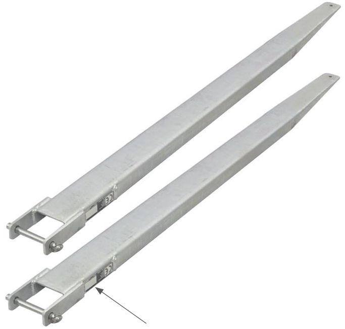
Protected license plate in the reinforcement section of the forks extensions