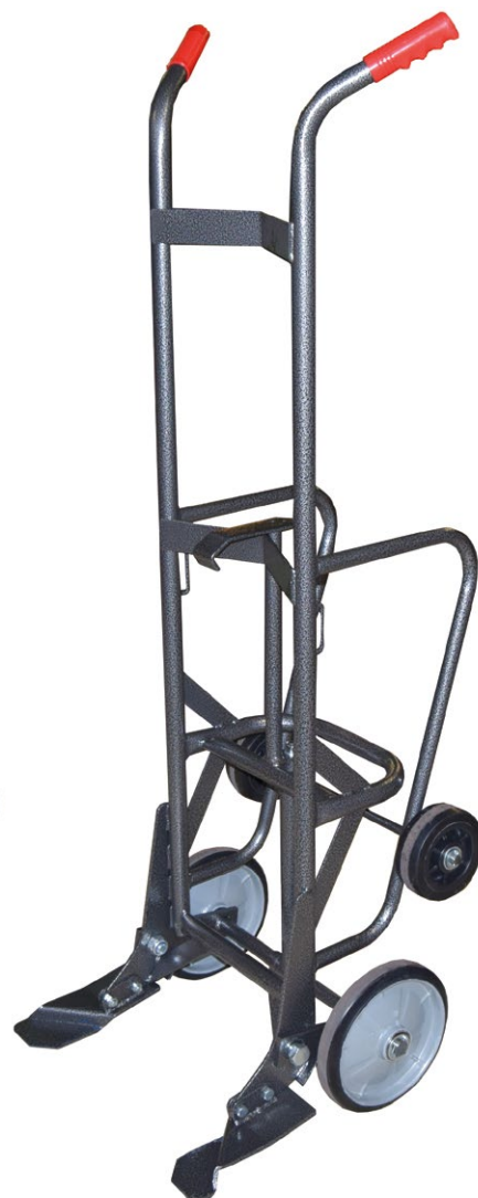
TILTING ASSISTANCE MECHANISM