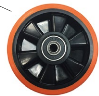
Silent non-marking rubber wheel with ball bearings