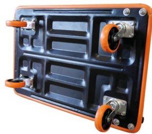
Reinforced lacquered steel frame and platform with anti-slip covering