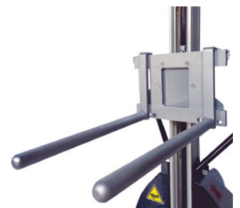
BINGO-DS Twin mandrel 600 mm