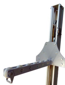
BINGO-SR Roller mandrel 540 mm