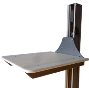
BINGO-P Nylon platform 600x500 mm