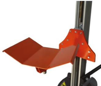
BINGO-BP V-cradle 600x400 mm