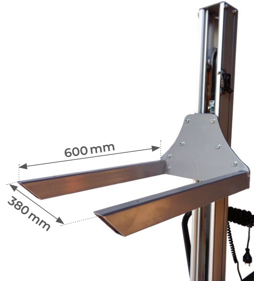
Forks come standard