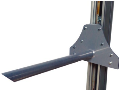
BINGO-S Reel mandrel 600 mm