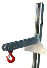
BINGO-G Jib arm with lifting hook 600 mm