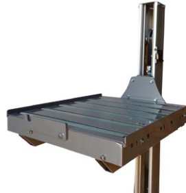
BINGO-C Load roller platform 600x500 mm