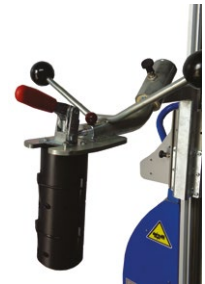
BINGO-R Reel handler