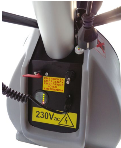
Control panel with integrated charger